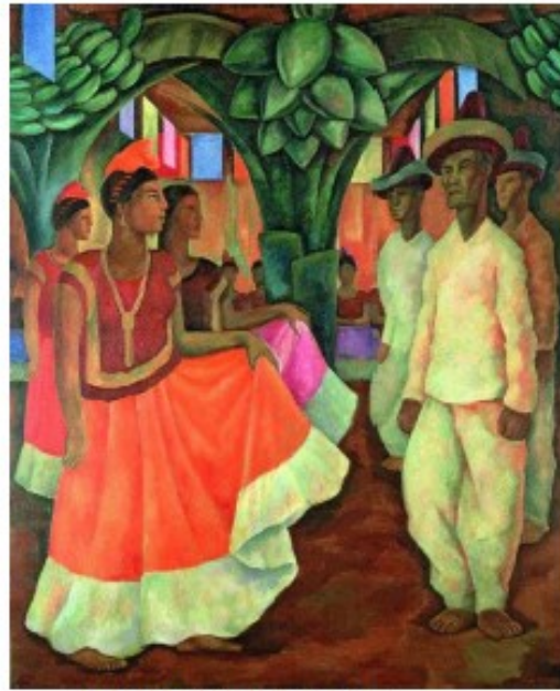
Baile de Tehuantepec, Diego Rivera

The Presbytery of Philadelphia and the Session and Congregation of The First Presbyterian Church in Germantown joyfully request the honor of your presence at the Service of Installation of